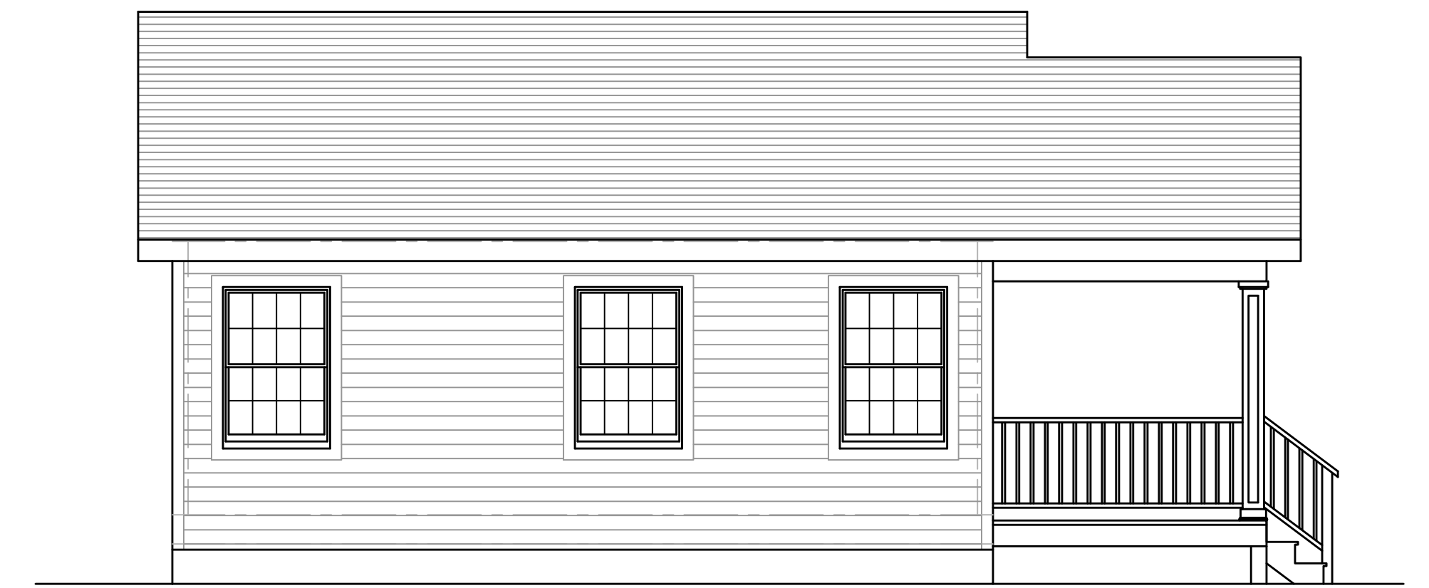
LEFT SIDE ELEVATION SCALE 1/4" = 1'-0"

Copyright © 2020 by J.S. Smith Architecture, Inc. All rights reserved. These plans are produced under Federal Copyright Laws. The original purchaser of this plan is authorized to reproduce the drawings for personal use only. No other reproduction, distribution, or use is permitted without the express written permission of the Architect. Contractor to read and understand all plans prior to bidding, construction or otherwise. Materials, methods, and details are subject to change without notice. All dimensions are in feet and inches and are to be reported to the architect for proceedings for completion. All dimensions are to be determined by the contractor. These shall be determined solely by the contractor.