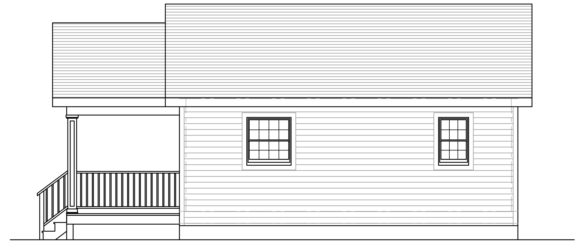
RIGHT SIDE ELEVATION SCALE 1/4" = 1'-0"