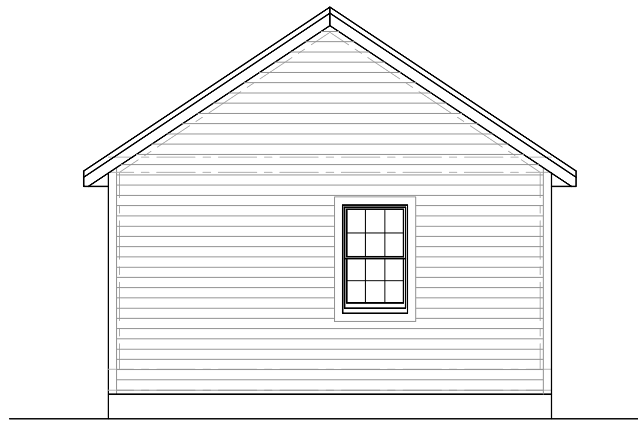
REAR ELEVATION SCALE 1/4" = 1'-0"